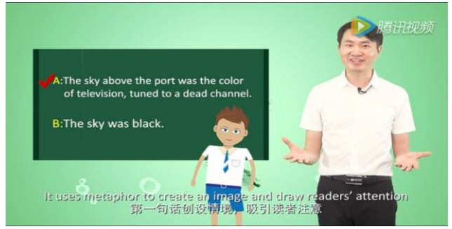
Fig.6: The screen recording example selected from Tencent video