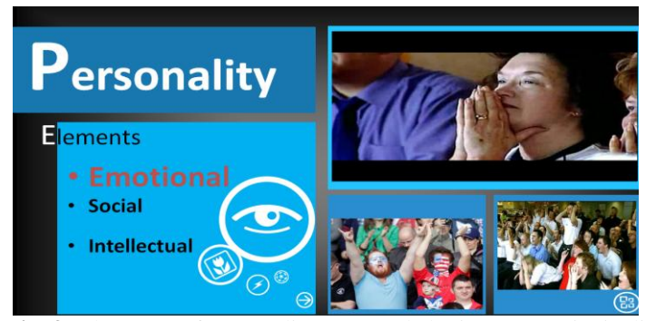
Fig. 3: The cover of Personality PPT made by instructor Li Xiaoli