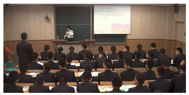
Fig.5: The micro lecture case recorded by external video camera (the author as the instructor)

Recording and modifying techniques: at present, there are a couple of popular ways to record and make micro lectures. The external video camera can be used to record the whole teaching activity including instructor, PPT and students. The screen recording software with PPT can be used to record the process of micro lecture. The video recording software, Camtasia Studio, is turned on, and the instructor put on microphone adjusting PPT interface. While the instructor is explaining, he can apply various multi-media or teaching materials to make the whole teaching process enjoyable and instructive. After recording, it's necessary to modify and beautify the videos. The professional micro lecture software represented by Micro Stage is the most modern one which utilizes the making system of micro lecture to explain the whole teaching process. Fig. 5 and Fig. 6 are practical examples to present the above recording method.